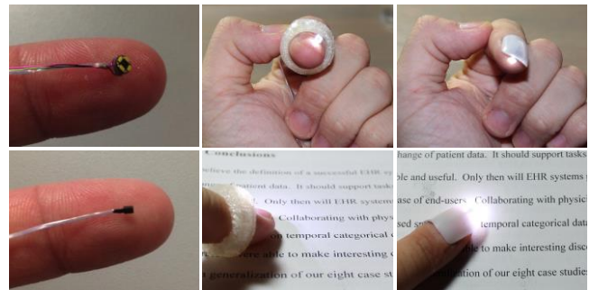
(a) NanEye2C with and without 4 LEDs. (b) Ring form factor (c) Nail form factor

http://dx.doi.org/10.1145/2700648.2811381