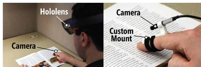
Figure 1. Prototype HoloLens and finger-camera system: (a) reading a magazine article; (b) close-up view of the camera.

a Microsoft HoloLens device [5]. Two previous approaches to magnifying information on a head-worn display have used video see-through displays where a video feed from a head-worn camera is displayed on screens in front of the user's eyes along with computer-generated content [3, 8]. In contrast, our approach does not restrict the user's field of view to only the camera view, allows for small finger movements to select the content to magnify (as opposed to head movements), and allows for 3D virtual content to be overlaid within the physical world. This lattermost characteristic is enabled by the HoloLens API, which provides robust 3D mapping and motion tracking to make AR content appear as if it is fixed in place in the physical world.