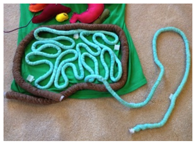
Figure 4: The small intestine (in light blue) unravels to help illustrate its extensive length.

children about anatomy and physiology. However, our current prototype is limited to the pulse sensor as a form of input and LEDs and EL wire as a form of output. In the future, we plan to explore the use of additional input including breathing sensors, a method of detecting swallowing, and temperature sensors. These new input devices will allow us to display real-time breathing, digestion, and body temperature on the shirt. Some organs are more difficult to sense and visualize than others ( e.g. , the heart vs . the pancreas). Thus, for all organs we plan to add physical labels attached via Velcro, and a touch sensor that plays back a short description of the specific organ.