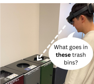
Answer: Landfill: waste such as food waste. Recycling... Compost...