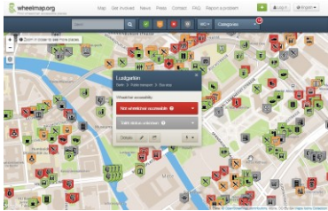
Figure 1. Wheelmap.org collects and visualizes the wheelchair accessibility of POIs such as bus stops, restaurants, and public bathrooms.