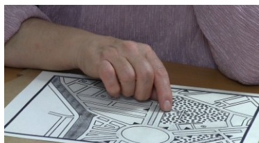
Figure 4. A visually impaired user exploring a tactile map.

Once data about physical-world accessibility is sensed or reported, it needs to be in a usable, standardized format. OpenSidewalks is focused on creating an open standard for pedestrian pathways, which includes accessibility standards [12]. Similarly, Wayfindr [11] is creating an open standard for audio-based wayfinding that includes POIs and landmarks that are relevant for navigation-based assistive technologies. Current projects, such as NavCog (Fig. 3) are using this knowledge both on real-world [14] and virtual [7] navigation apps for blind people. Besides wayfinding, broader work needs to be done to support a wide range of useful assistive applications, including: accessibility-aware POI search, personalized routing along accessible paths (similar to accessmap.io [3]) and interactive visualizations of neighborhood accessibility (similar to Walkscore.com but with accessibility information).