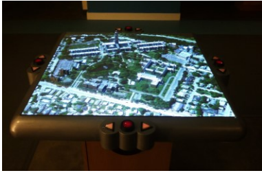
Figure 5. Perkins School for the Blind: Talking Campus model by Touch Graphics.