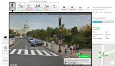
Figure 2. Project Sidewalk [13] is an online tool that collects data about sidewalk accessibility via remote crowdsourcing and virtual walkthroughs of city streets.